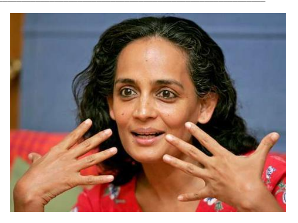
Arundhati Roy From www.openesf.net