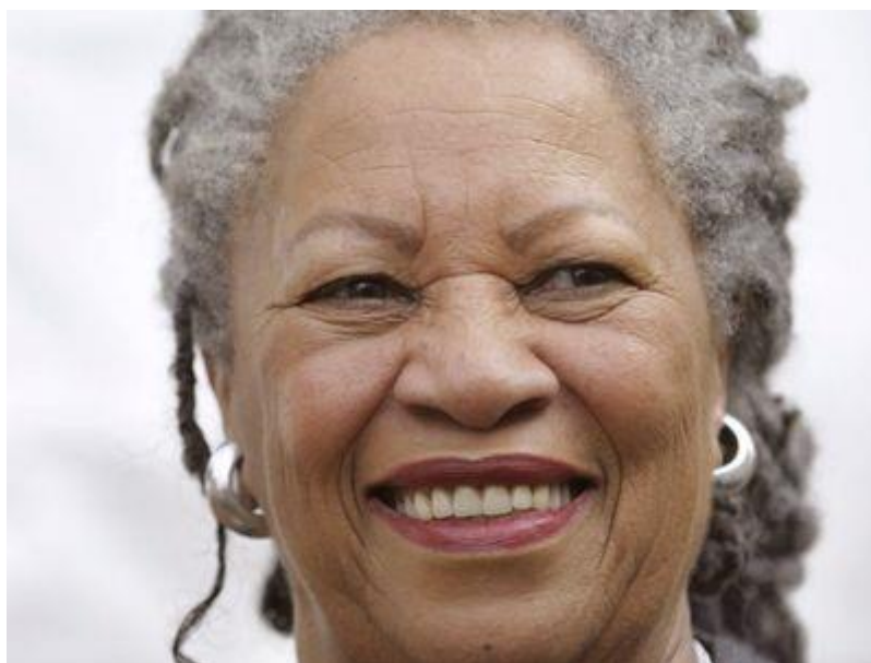
Tony Morrison (1931-2019)

(coming-of-age novel) types of novels. In Beloved , Morrison shows her mastery over going deep down to the complex psyches of numerous characters who endure the horrific burden of slavery's folded and unforgivable sins. The story is based on a real-life situation of a black slave woman, Margaret Garner, who escaped from Kentucky plantation, killed her own daughter to emancipate from the terrible bondage of slavery. In Morrison's view slavery denied black slave mothers the right to feel maternal love. They were not destined to be entitled to motherhood. These women were not mothers but breeders. The black women were brought to America to breed slaves and to attend to the personal needs of slave holders, to care for their families and to work in their fields.