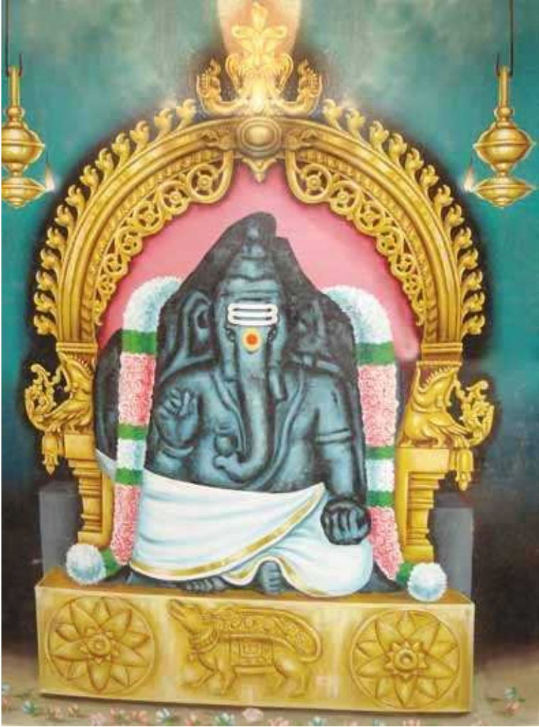
Pollappillaiyar in Tirunaraiyur Temple