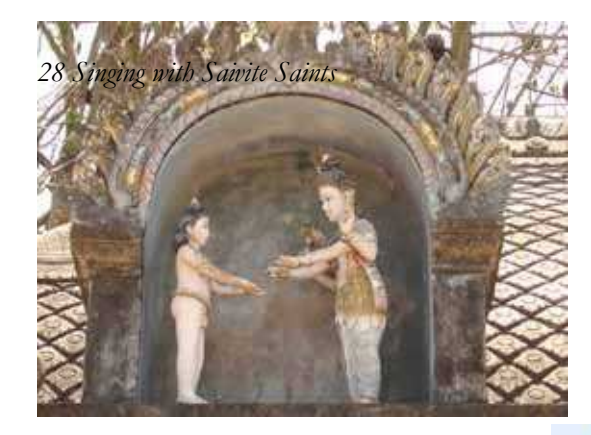
Gets cymbals -Tirukolakka (Gopuram)

Milk of wisdom from Parvati (Sirkazhi, Arch Water Tank)