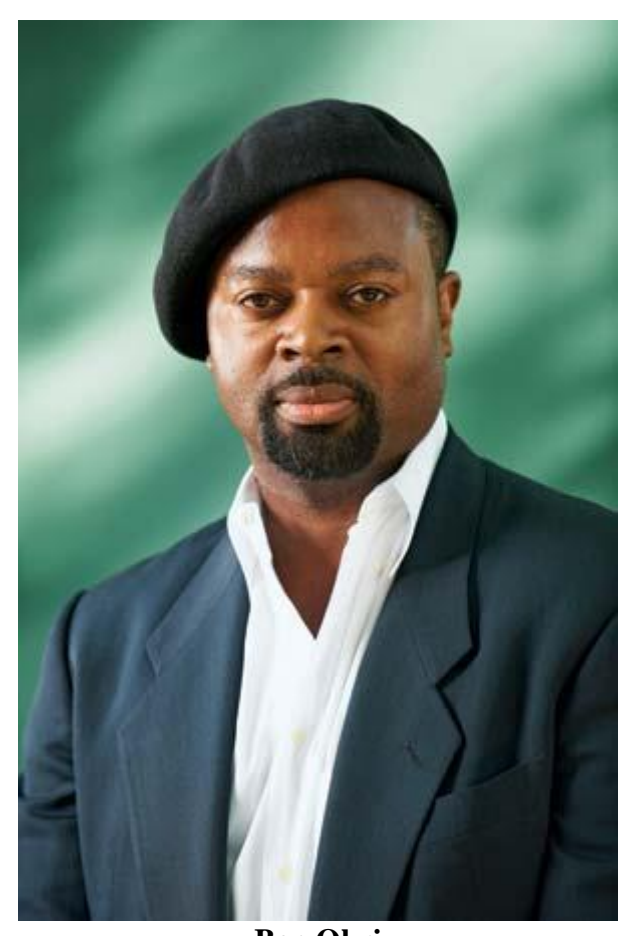
Ben Okri

Keywords: Nigerian myths, Yoruba (Urhobo) culture, Ben Okri, magical realism, African folklore, Nigerian political problems