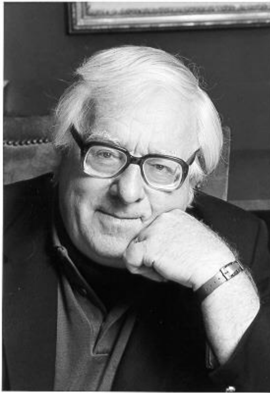
Ray Bradbury 1920-2012

Courtesy: http://books.blogs.starnewsonline.com/16027/ray-bradbury-r-i-p/