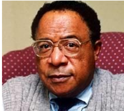
Alex Haley (1921-1992)