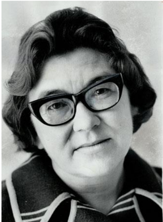
Margaret Laurence (1926-19870

Keywords: women's suppression, Hagar, The Stone Angel , Margaret Laurence, Manawaka, feminist outlook, new woman, family relationship, pride.