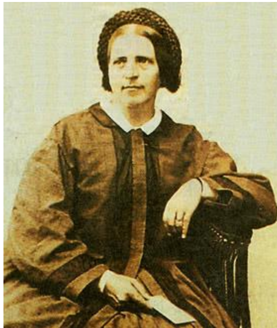
Johanna Spyri, 1879

Keywords: Heidi , Family, character, behaviour, nature, imbibe, generosity