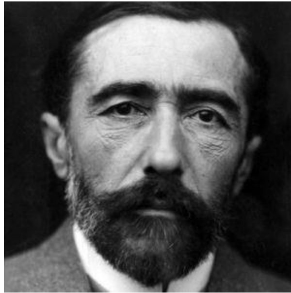
Joseph Conrad 1857-1924

form Conrad's experience of his own trip down the Congo in 1890 and that made it a great work of art.